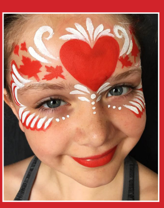
Artists listed left to right, top to bottom row.