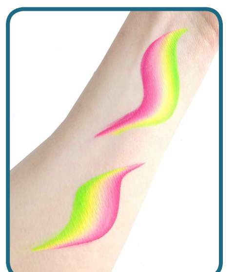
Step 2: load two colours on a #6 brush, press and repeat to make quick petals!